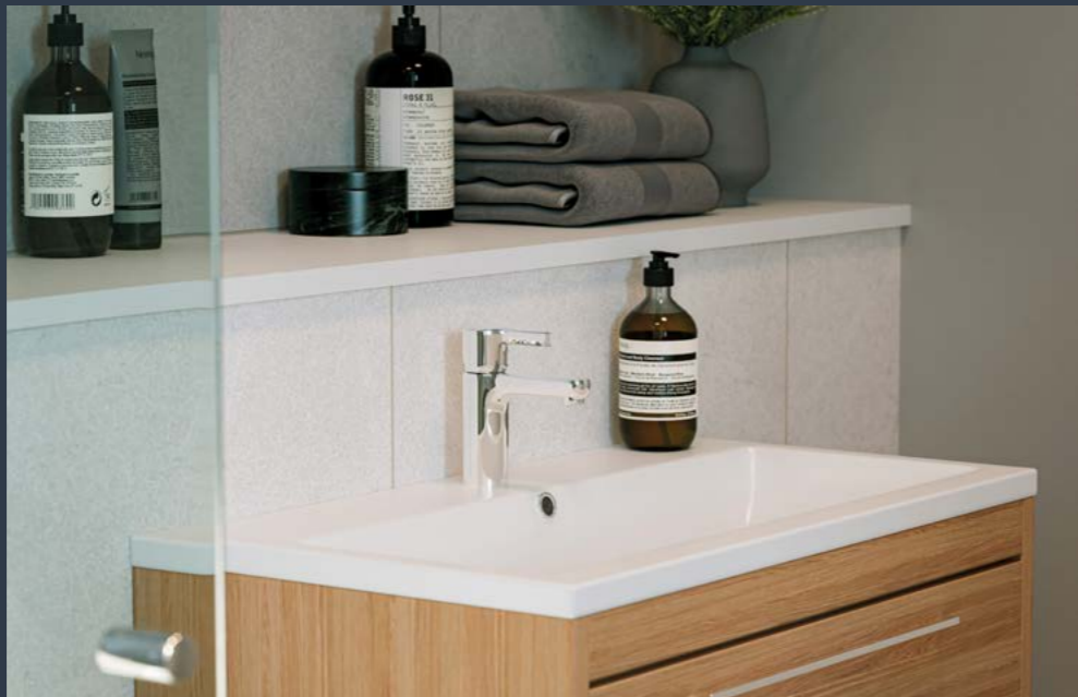
Images shown are computer generated images of Birchwood House, Kingswood Gate.